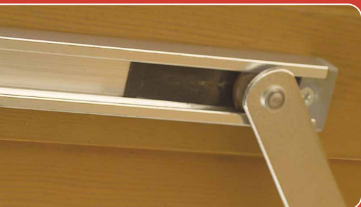
Smooth roller action with 90° hold-open

The Lockwood surface mounted door stay provides effective door control for medium to light duty doors. These products mount to the surface of the frame and require a minimum amount of door and frame preparation. Lockwood 8001S door stays are ideally suited for medium to light duty applications where the expense of a hydraulic door closer cannot be justified.